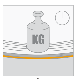
Very small creeping throughout time