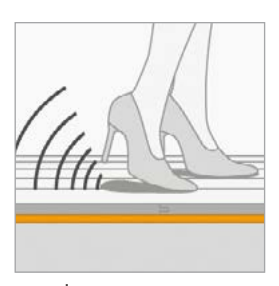
Reduces impact noise by 30% 1)