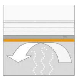
Excellent barrier against moisture