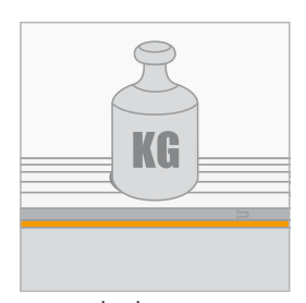
Very high resistance to compression